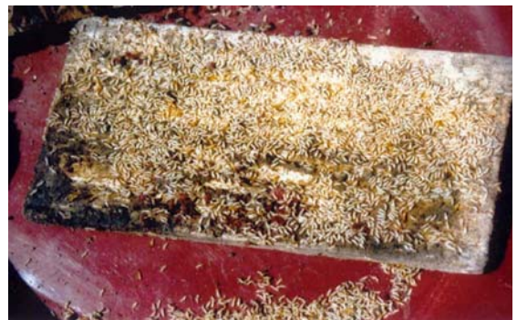
Termites on Wooden Slice